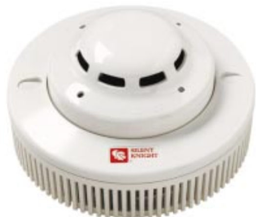
Assembled With Detector and 6" Base (Detector sold separately)