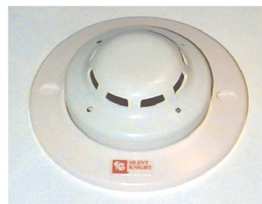
SD505-APS Smoke Detector